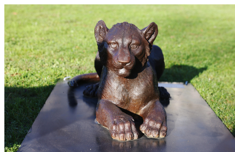
No. 16 Length:133cm, Width: 73 cm, Height: 43cm, Weight: 139 Kg Square metres: 0.97