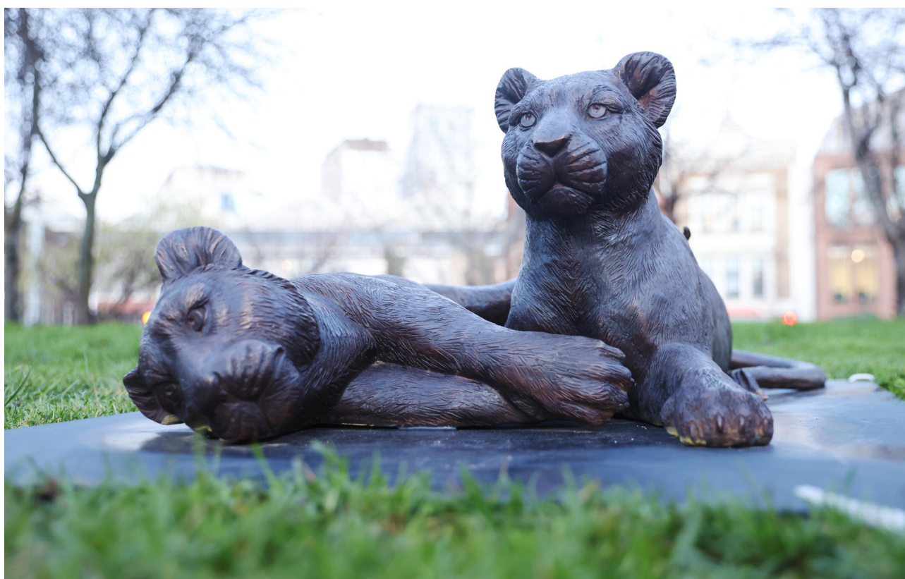
Double Cub Sculpture (No. 14)

Length:155cm, Width: 130cm, Height: 97cm, Weight: 371 Kg, Square metres: 2.02