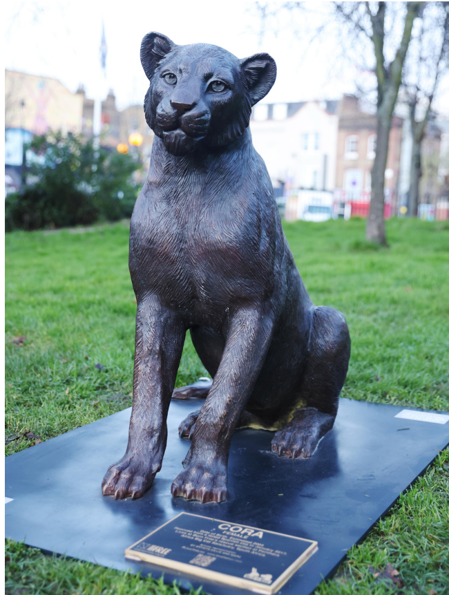
CORA (No. 13)

Length: 135cm, Width: 95 cm Height: 108cm, Weight: 220 Kg Square metres: 1,28