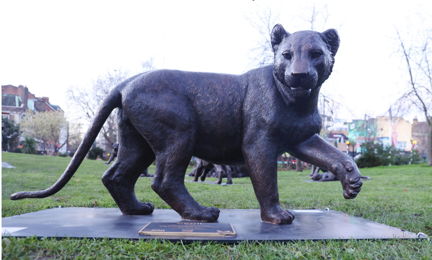
CECIL (No. 18)

Length: 155cm, Width: 84 cm Height: 82cm, Weight: 230 Kg Square metres: 1.30