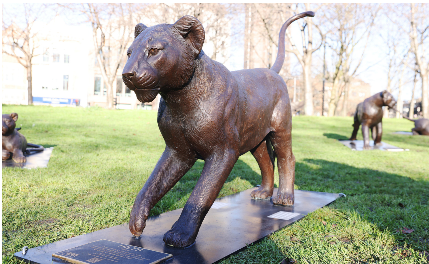
'HILTS' (No. 9)

Length: 170cm, Width: 55 cm, Height: 111cm, Weight: 200 Kg Square metres: 0.94