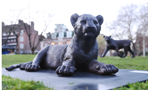
No. 15 Length: 127cm, Width: 79 cm Height: 43cm, Weight:143 Kg Square metres: 1.00