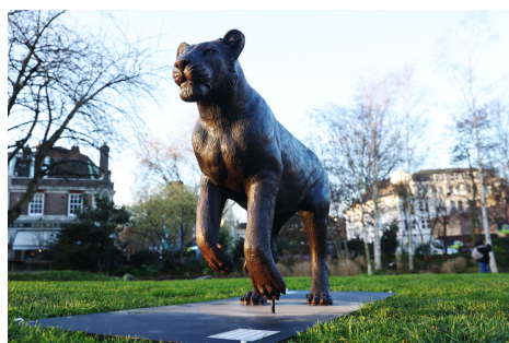
No. 8 Length: 185cm, Width: 65 cm Height: 90cm, Weight: 210Kg Square metres: 1.20