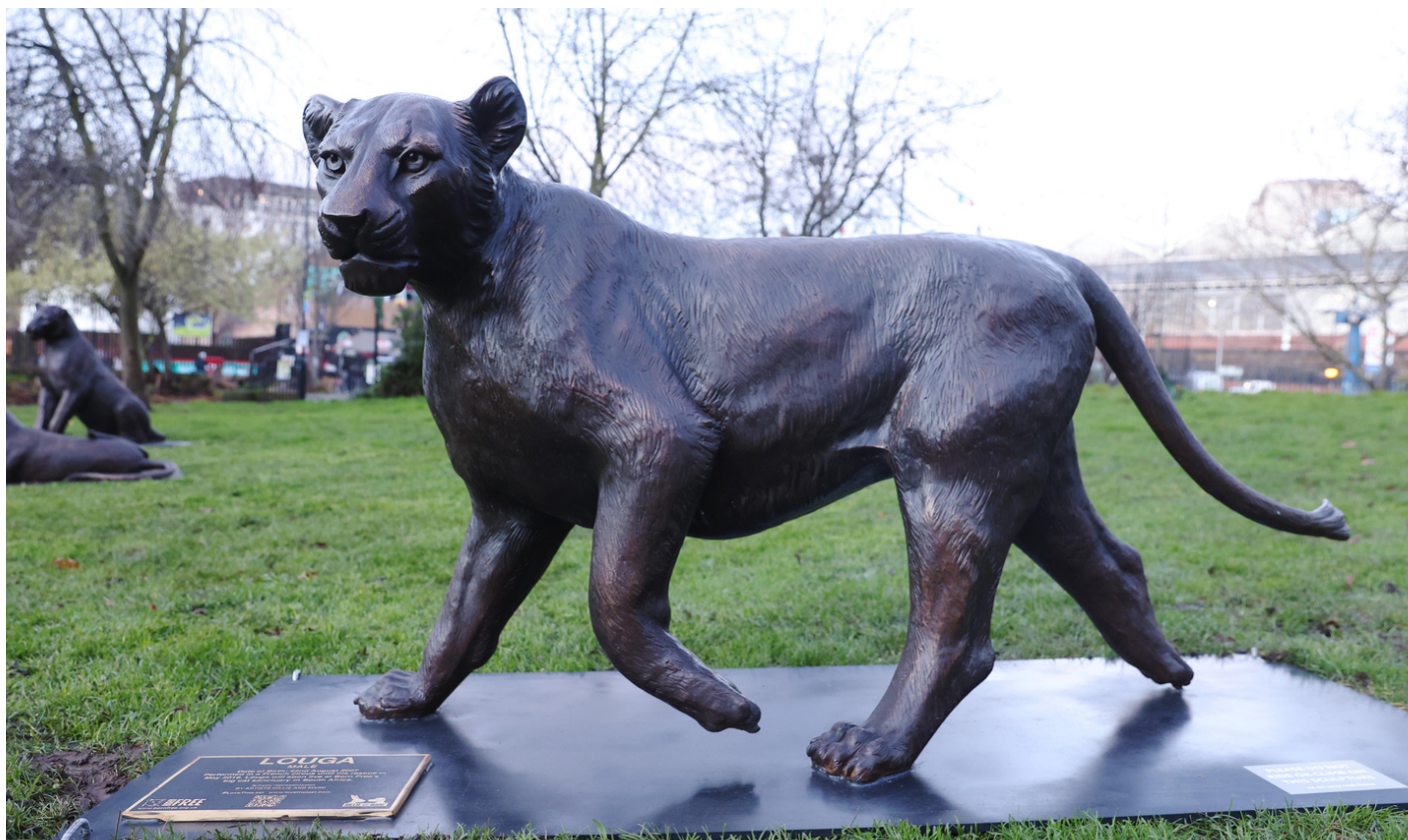
LOUGA (No. 17)

Length: 175cm, Width: 74 cm Height: 90cm, Weight: 230 Kg Square metres: 1.30