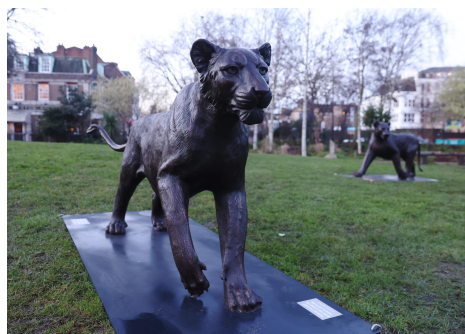
No. 1 Length:190cm, Width: 60 cm, Height: 90cm, Weight: 210 Kg Square metres: 1.14