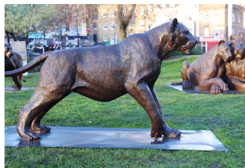
No. 3 Length: 200cm, Width: 82cm Height: 100cm, Weight: 268 Kg Square metres: 1.64