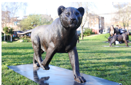
No. 2 Length: 190cm, Width: 74cm Height: 90cm, Weight: 238 kg Square metres: 1.41