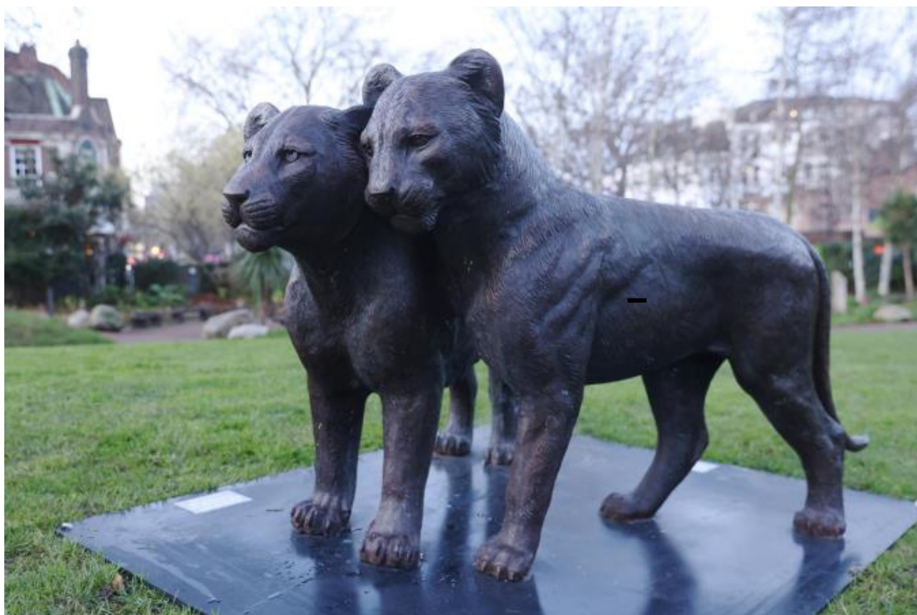
Double Cub Sculpture (No. 6)

Length:155cm, Width: 130cm, Height: 97cm, Weight: 371 Kg, Square metres: 2.02